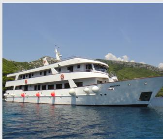
Our Cruise Boat

The advance party will spend a relaxing week cruising on the Adriatic Sea from Dubrovnik to Split taking in the rugged, beautiful Croatian coastline with stops in idyllic destinations including Split, Hvar, Korcula and Mljet. This is the entrée to the main tour and is purely for recreation and having fun. Split is on the Adriatic's eastern shore and is a link to numerous Adriatic islands and the Apennine Peninsula. These small atolls of Hvar, Korcula and Mljet are covered in pine forests, vineyards, olive groves, fruit orchards and lavender fields with Hvar listed in the top 10 islands to be visited.