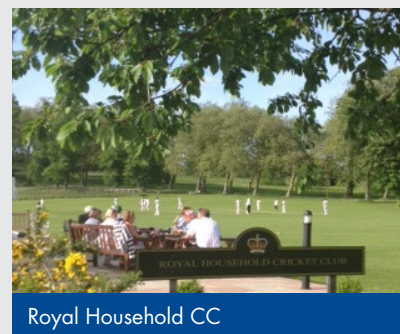
Royal Household CC

After Notts it's down to London and Brentford with a string of traditional games at historic venues including a finale at Sir Michael Parkinson's home club. For the adventurous ones, a two hour train trip from Paddington to Cardiff Central will get you to the First Test in Wales and the picturesque Sophia Gardens Cricket Ground. A few days in the heart of London and the Second Test at Lords will draw the curtains on this "not to be missed" tour!