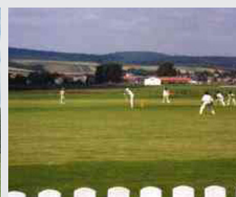
Seebarn - Austria