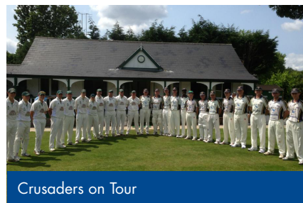
Crusaders on Tour