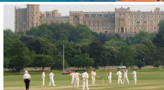
Cricket at Windsor