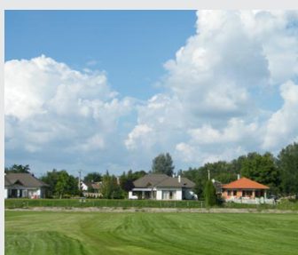
Hungary Cricket Ground

The second entourage joins us in one of the most beautiful cities in Europe, Budapest. Hospitality plus will greet us here as we renew acquaintances with the members of the Hungarian Cricket Association. An evening dinner cruise on the majestic River Danube will be a highlight of this stay. Our opening cricket duties will see us join 4 or 5 other European teams in a "Spirit of Cricket" weekend in Hungary. From there it's off to spectacular Vienna and games against the Vienna CC after experiencing an afternoon exploring this romantic city of music and dreams. A lively evening in a traditional Viennese schnitzel and strudel restaurant, with our Austrian Crusader friends, will follow the cricket.